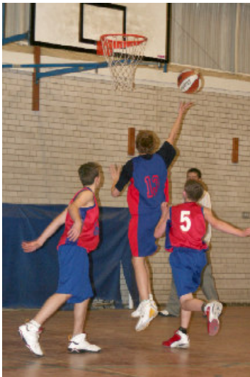
Action from a recent match

"If guys don't play defence, then I'm in a position to where they don't have to play."