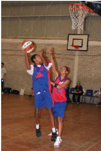
Action from a recent match