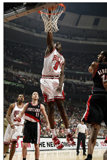
Above: Luol Deng in action for Chicago Bulls