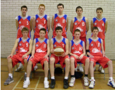
Dorset Storms Under 18s National League Team

“Great effort springs naturally from great attitude.”